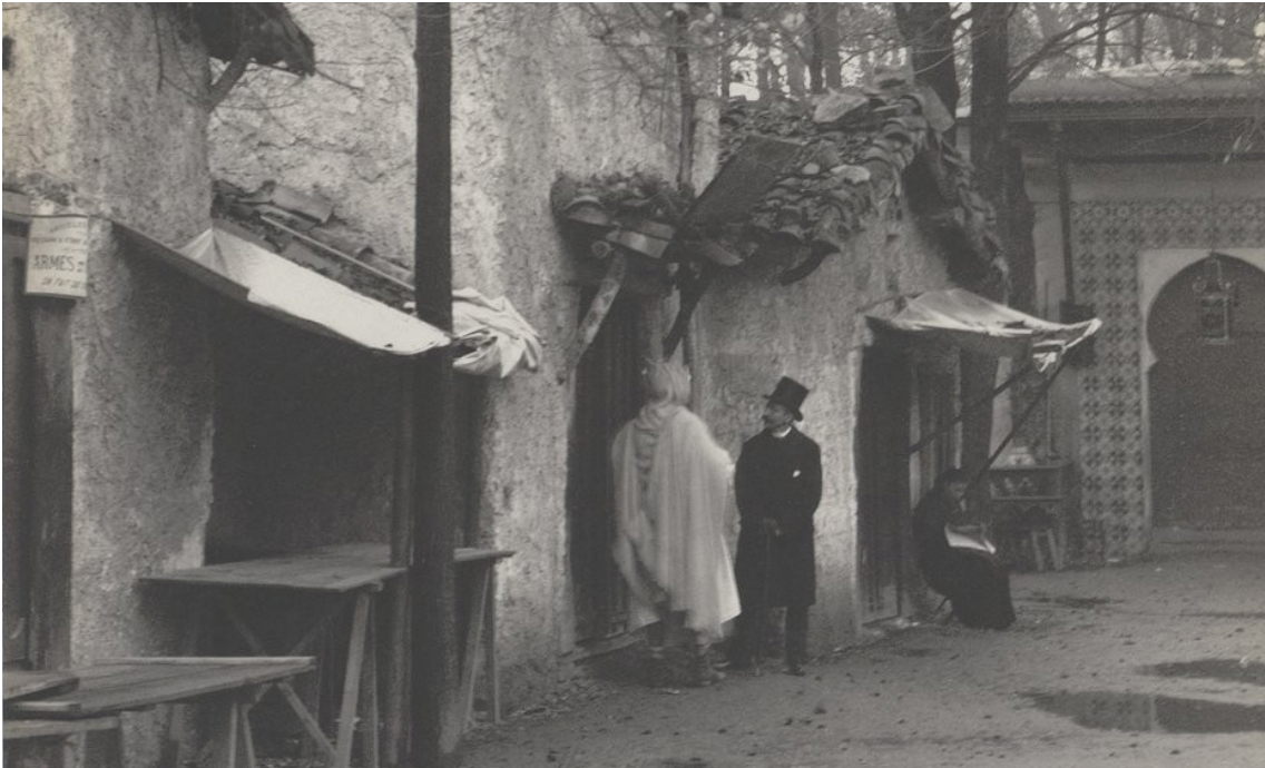
An Algerian and European man speak in front of a Kabyle home, 1889