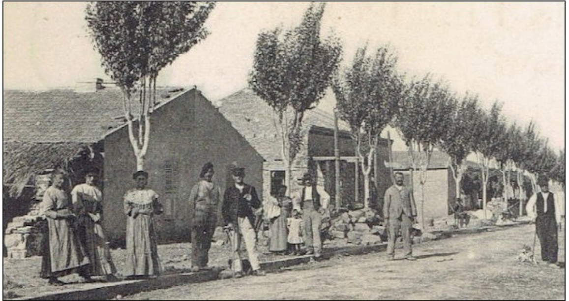
French settlers in the town of Prévost-Paradol (now Mechera Sfa), c. 1900-1903

[These are] considered as special infractions of the Indigénat, and, as such, subject to penalties governed by articles 465 and 466 of the penal code: