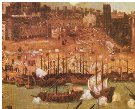
Sixteenth-century shipyards in Seville, Spain, where all traders were supposed to pass

Meanwhile, pirates also found it possible and profitable to raid and trade with on-land settlements. Caribbean towns that the Spanish crown didn't invest in fortifying were often left to defend themselves from attackers as best they could. Though a seemingly small portion of the Atlantic, the Caribbean Sea is enormous in its own right: its c. 1 million square miles were impossible to patrol. Given the financial pressures facing the Spanish crown, this do-nothing (or do little) approach to American defense was the only option. If merchants and colonists wanted to protect their lives, their businesses, and their goods, they would have to finance protection on their own. Meanwhile, contraband traders of all sorts, including pirates, could largely do as they pleased.