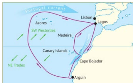
The Atlantic Islands: Azores, Canary Islands, Cape Verde, and Madeira

Although American wealth increasingly drew competitors to the Caribbean, the first burst of Atlantic piracy occurred in the so-called “Atlantic Islands” (the Azores, the Canaries, Cape Verde, and Madeira) off the coast of the Iberian peninsula and West Africa. In 1523, the French corsair Jean Florin captured several Spanish ships off Cape St. Vincent in southwest Portugal. The ships, which had already been attacked once by pirates in the Azores, were carrying a portion of Aztec treasure stolen from ruler Moctezuma. Florin took the lion’s share: some accounts said he made off with 62,000 ducats in gold, 600 marks (equal to roughly 300 pounds) of pearls and several tons of sugar. One of Hernan Cortés’s men, who had been in charge of seeing this treasure back safely, was captured and held prisoner by the French until 1525 before being ransomed.