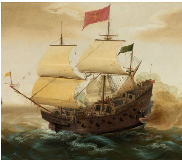
Painting by Cornelis Verbeeck depicting a Spanish galleon firing its cannons, seventeenth century

European governments could never fully control the flow of humans and commodities into and out of American settlements. It is unsurprising that colonists, both free people and unfree people, found ways around the rules. Piracy was a part of life and a reflection of the inequalities and opportunities that characterized the emerging Atlantic world. Pirates and piracy emerged in response to imperial success—meaning the growing number of trade routes and treasure-bearing ships crossing the Atlantic—and in reflection of just how inadequate and imperfect these early empires were.