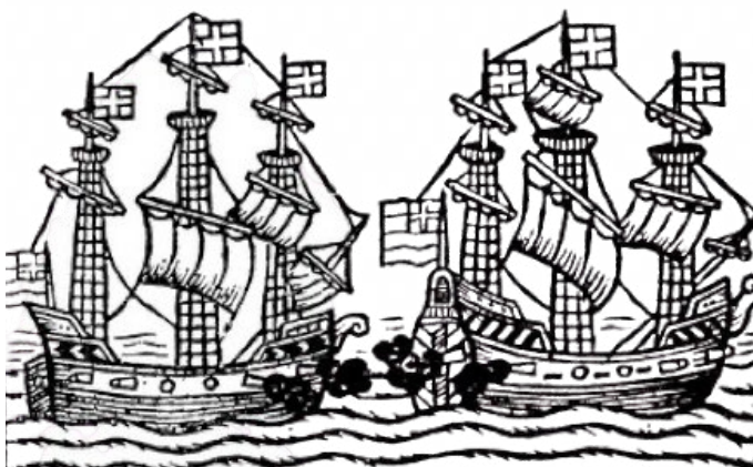
Seventeenth-century woodcut depicting a pirate skirmish

With Florin’s attack on Spanish ships in the eastern Atlantic, the great age of Atlantic piracy had begun. Tales of piracy and the valuable booty generated by pirate raids circulated in port towns and beyond and were often the way that people learned about the new world of Atlantic exploration. Imagine the excitement that rippled through seaside towns as pirate ships sailed in with stolen goods and crews telling stories of battles and victories on the high seas. Think about how these stories would have landed in the ears and minds and hearts of people who were far away from the centers of imperial power: you didn’t need to know how to read or be a sailor or high-ranking official to understand that whatever was going on in the Atlantic was exciting and full of opportunities for money and adventure. Even as they attacked official boats and settlements, pirates contributed to the success of empire by spreading excitement and news about Atlantic colonization alongside the plunder they took. Through their exploits, pirates generated thrilling tales about new places, new peoples, and new products from the emerging Atlantic World. Their bold outlaw behavior suggested that there was a place for personal ambition and an escape from the constraints of society. 500 years ago—like today—this was a very appealing fantasy to many people, for all sorts of reasons.