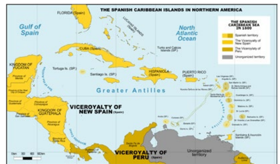
The Spanish Caribbean, c. 1600

As pirate attacks on ships returning to Spain from the Caribbean and the American mainland increased in the early decades of the sixteenth century, the Spanish crown tried to come up with ways to protect its American treasure fleets. The crown established a system of escorting treasure ships, called the convoy system, in 1525. Fleets were made to travel in convoys as early as 1525. By 1552, merchant ships were ordered to travel armed, at their own expense. Less than a decade later, in 1561, the crown established a new tax called the avería to help pay for a formal fleet system. The avería in theory financed protection fleets for official voyages. However, the merchants who had to pay this tax (and who were themselves the victims of piracy through the loss of their goods) did not support this new requirement. They objected constantly to the tax and found ways to cheat the system. Despite these measures, without a professional navy, Spanish protection for ships was limited. Spain's reluctance to finance a professional navy in the Atlantic would have lasting effects, even though at the time it seemed practical given the many financial pressures the crown was facing (of which the costs of the new settlements in the Americas were only one.)